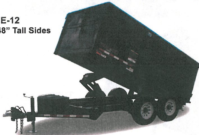
HE-12 -48" Tall Sides

THOMAS BUS SALES INC. 5636 NE 14th Street DES MOINES, IA 50313